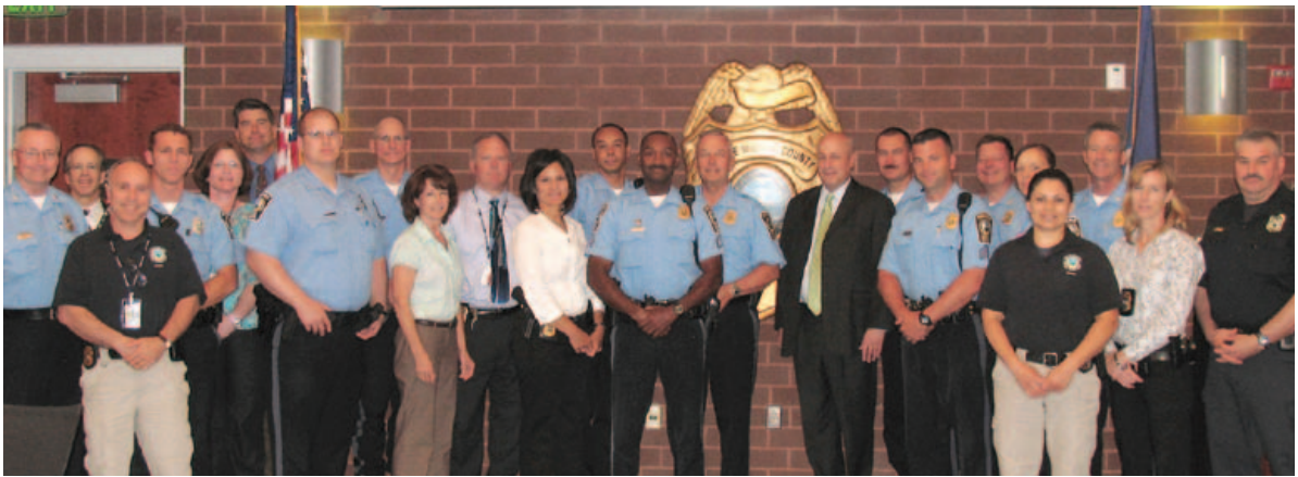
PERF Executive Session in Prince William County, Virginia on June 7, 2011

policy for undocumented immigrants. Bloggers and community activists began to push for change in the county's immigration enforcement efforts.