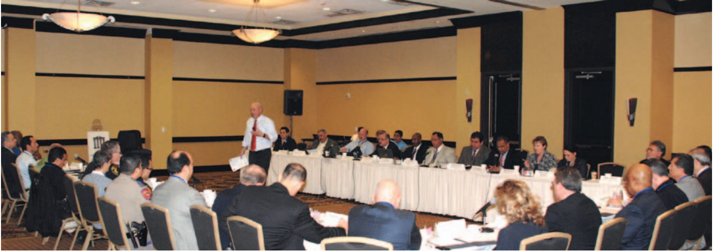
PERF Executive Session in Laredo, Texas