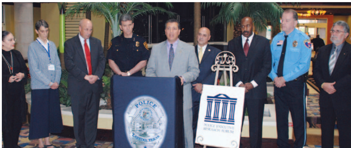
Press conference at Laredo, Texas PERF Executive Session on immigration

We have poured millions of dollars and thousands of people into our response to the immigration issue; we have created virtual fences and real fences, and we're still here today looking for solutions. I would suggest that immigration means one thing to local police: a concern that there is a movement to burden local police officers with immigration enforcement. And the concern is that when that happens, we will be robbing our communities of the police response that they deserve.